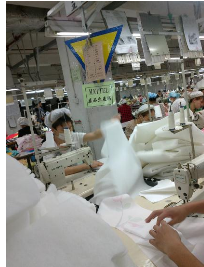
Mattel Sign in the Workshop

The labor contract states that on average, a worker's overtime hours will not exceed 36 per month. In reality, every worker works 2 hours of overtime each day and 8 hours of overtime on Saturday. Although this is clearly in contradiction with the factory's labor contract, none of the interviewed workers knew if this work hour system had ever been investigated by the labor department. There wasn't any sticker or file attesting to such an investigation anywhere in the factory. Workers may also receive exemption from working overtime hours with the approval of their workshop supervisor.